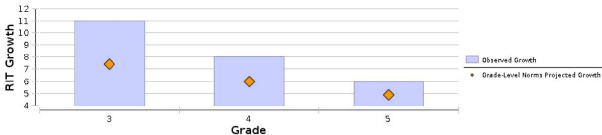
Math: Math K-12